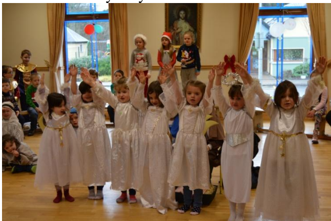
Nativity Plays - Christmas 2015